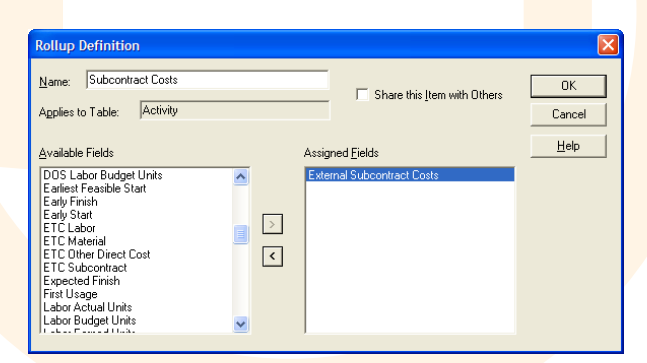
In the example shown above, a user performs a rollup of External Subcontract Costs.

The new Rollup utility enables users to perform a rollup of selected date and numeric fields. Rollups may be defined for activities, resources, and codes. A Manage Rollup dialog box provides access to add, edit, delete, and apply options. Rollup definitions may be confidential to the creator or shared with all users in the same manner as calculated fields and filters.